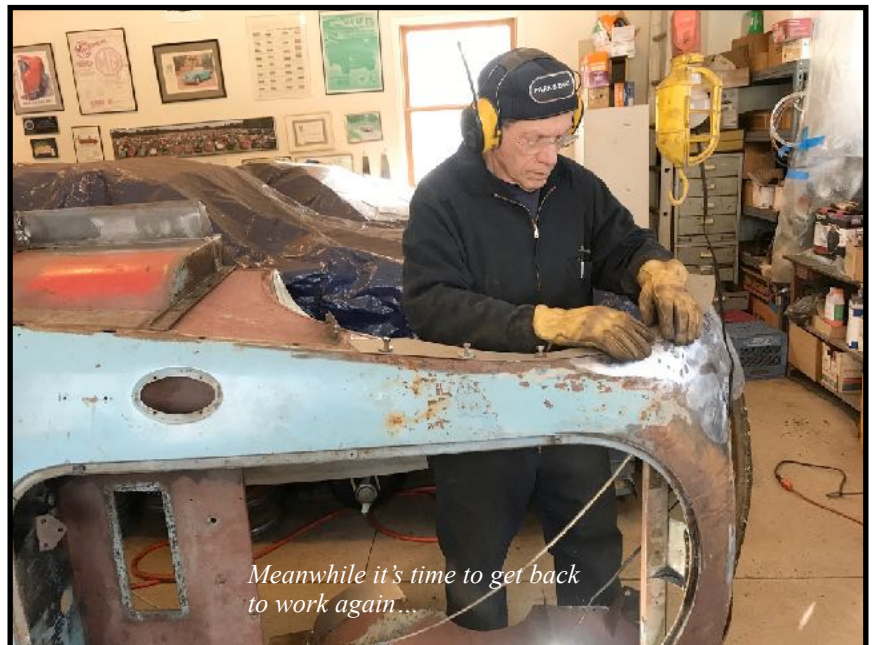
Meanwhile it's time to get back to work again...