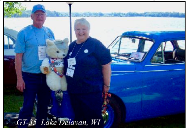
GT-35 Lake Delavan, WI

After sorting out the MGA's endless issues that spring we took the ferry across the lake. Departing the ferry the car balked and stalled. I was able to force it into a lower gear. We then drove 20 miles south of Milwaukee in 3rd gear to get us out of the inner city. Upon stopping, the transmission was bone dry, locked in