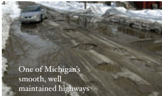
One of Michigan's smooth, well maintained highways