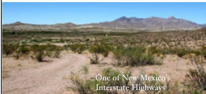
One of New Mexico's Interstate Highways