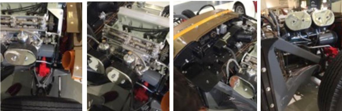
MGA Twin Cam cut Away Above & Left, and MGB-GT cut away below.