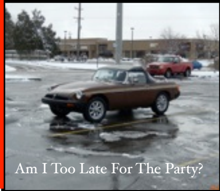
Am I Too Late For The Party?