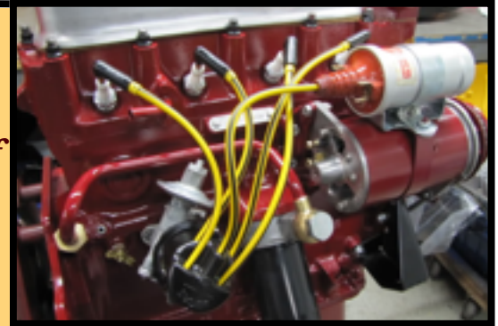
Before You Mess With This Side Of The Motor...

"Cliff Notes Summary of Above Article: See caption below pics"