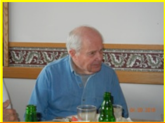
Showing The Colors