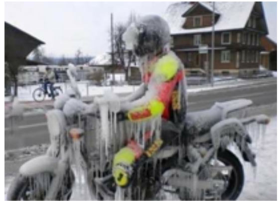
Waiting for spring

I enjoyed seeing you all in Holt on April 9 at the Kimber Birthday Party. Driving season is just around the corner. Get your MGA ready!