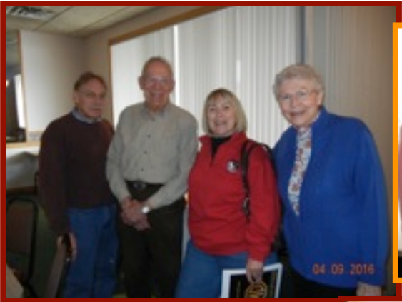
(Kimber Meet Pics Continued)