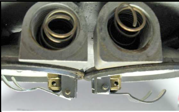
Lid on left above has taller stand for float arm and shows incorrect pairing with float lever. Lid on right has more common short stand for float with correct lever arm pairing.