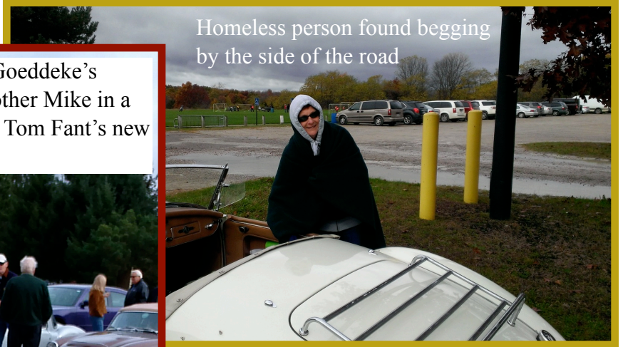
Homeless person found begging by the side of the road