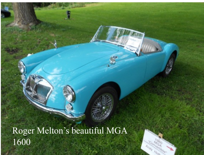
Roger Melton's beautiful MGA 1600

In Depot Town, there is a great restaurant called "Sidetracks". It is right next to an active