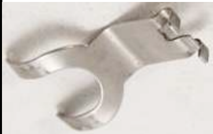
AUD2285 float lever for later lid with taller stand. Note "Z" type bends along arm to give correct height at point of contact with shut off needle.