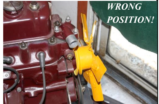
FAN FITTED BACKWARDS

With a plastic fan the deep dished side faces the radiator and if these fans are fitted in reverse you normally see the blades contact parts of the engine, unless someone has fitted an extra spacer to get clearance rather than stand back and give some more thought as to why this is happening! Note that the mechanical fans turn clockwise when standing in front of the car looking at the engine. Look at the leading edge of the three blade metal fan and you see it has a curved edge; the leading edge is the one that cuts into the air. The six blade fans have a clear cut out on the leading edge, and the plastic fans have a subtle curvature down the length of the leading edge, whilst the trailing edge is almost straight. In addition all blades are curved and the concave side faces the engine. Fit the fans in the reverse position and aside from clearance problems their efficiency will be noticeably reduced."