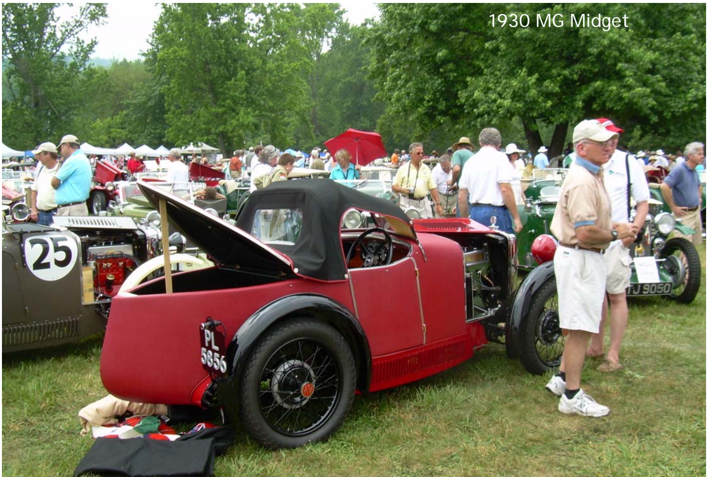
1930 MG Midget

Only $27.00, which includes the shipping cost.