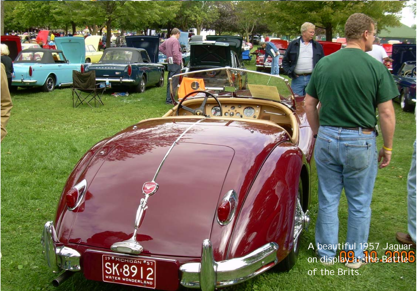
A beautiful 1957 Jaguar on display at the Battle of the Brits.