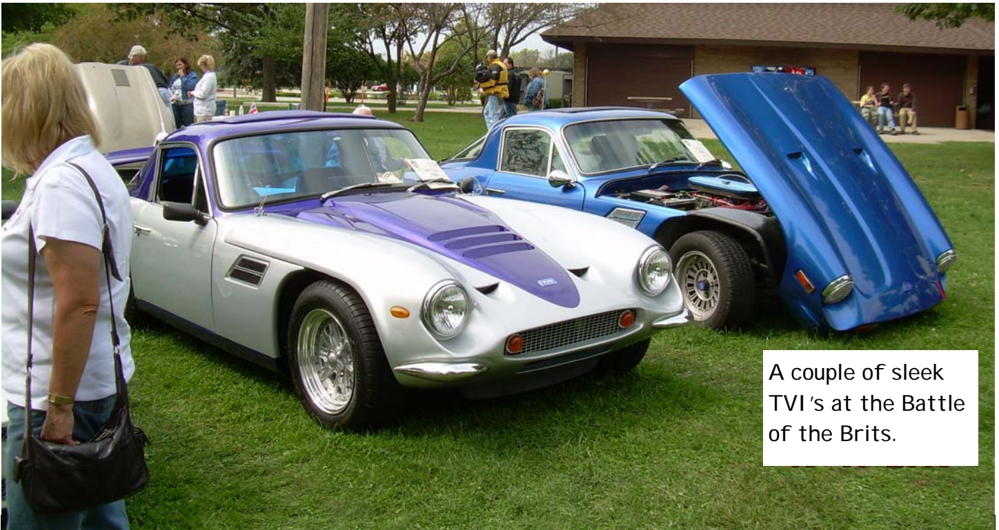
A couple of sleek TVI's at the Battle of the Brits.