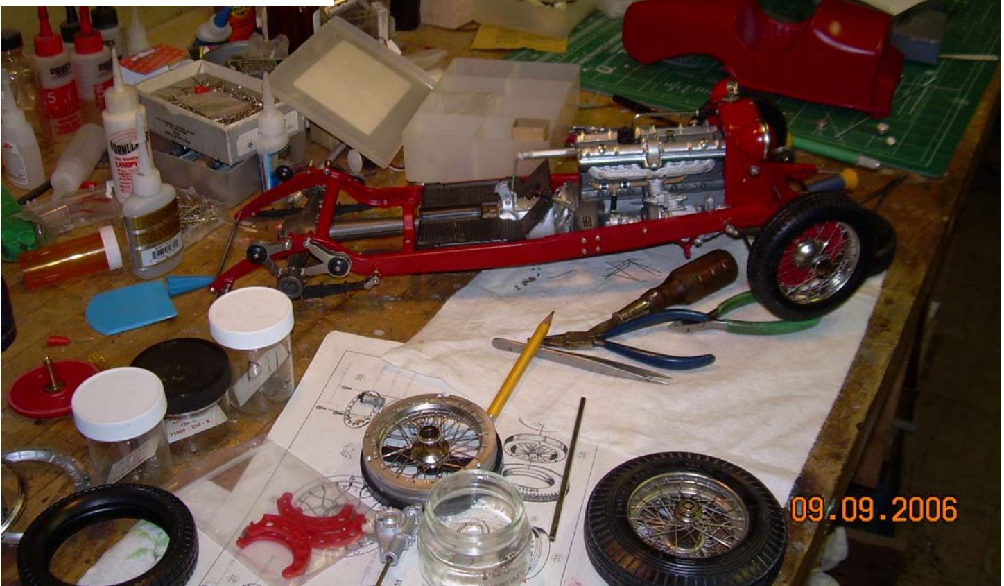
One of Neil Griffens latest projects, a 1931 Alfa-Romeo Monza, detailed model seen at the SeptembeFast meet.