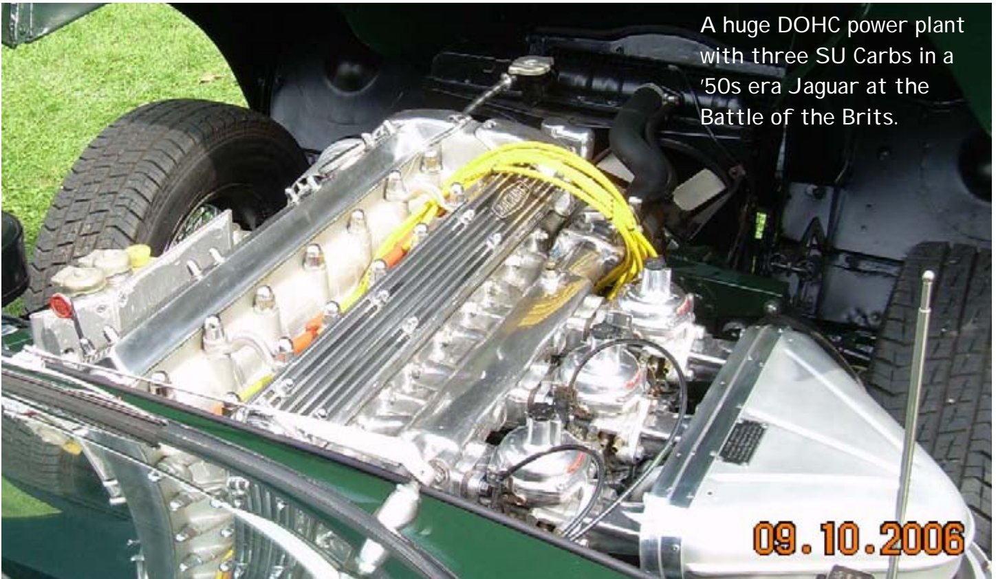
A huge DOHC power plant with three SU Carbs in a '50s era Jaguar at the Battle of the Brits.