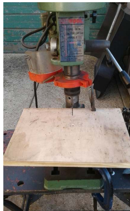
The drilling table.

So, that is the very important bit of the process started, getting the geometry right.