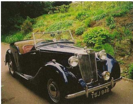
May 2001 – The MG is ready for excursions but still with old seats.