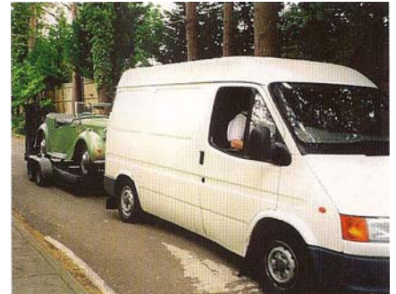
October 1998: On the trailer behind the Ford Transit at last arrives in West Sussex.