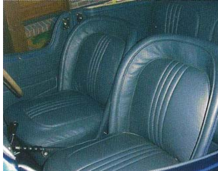
Autumn 2001 – The new interior shines in new gloss.