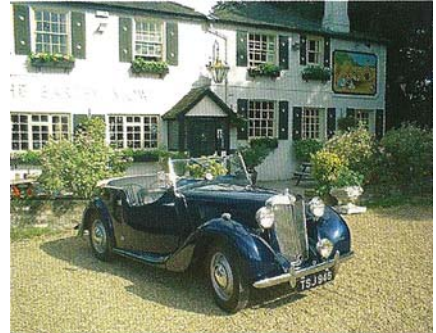
June 2002 – The restoration is complete.