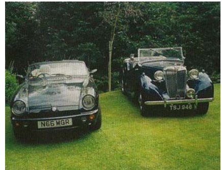
August 2002 – The Pelham Family's cars. Shirley's RV8 (in the same dark blue colour as Victor Rodrigues' example) next to David's YT. What a beautiful duo.