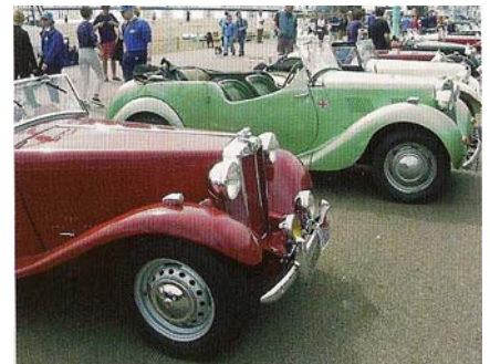
May 1999: First Day Trip – the Regency Run to Brighton.