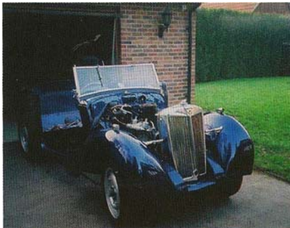
YT4619 shines in its new blue nearing completion.