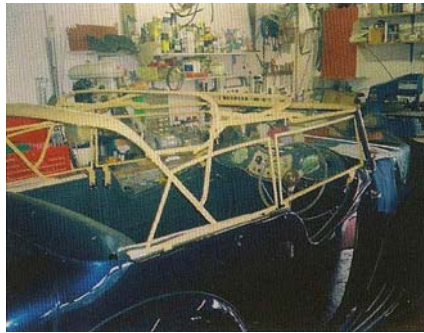
September 2011- The new hood and side screens being installed.