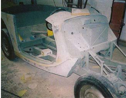
Autumn 2000 David starts a total restoration stripping the car to bare metal.