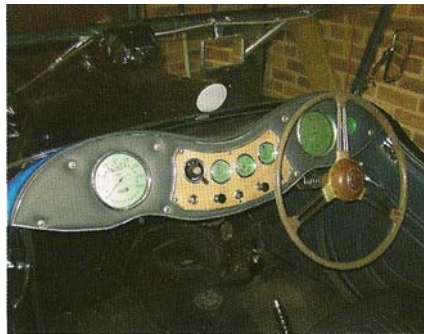
Also the dashboard has been restored.