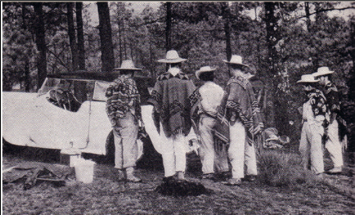
The very first M.G. to scale the slopes of Nevada de Toluca – and a conference to decide how to dismantle and reroute this apparent messenger from the heavens.

we were ready to leave we met three Indians walking along a circular track leading into the crater. We exchanged greetings: