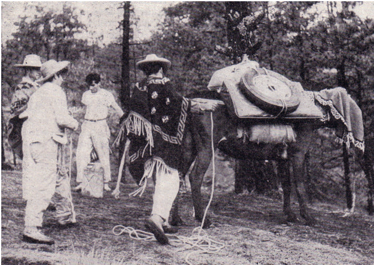
As seats and spare wheel are tied to the back of a Mexican pack-horse, a blanket is put over the animal's head to prevent it taking fright at this unusual cargo