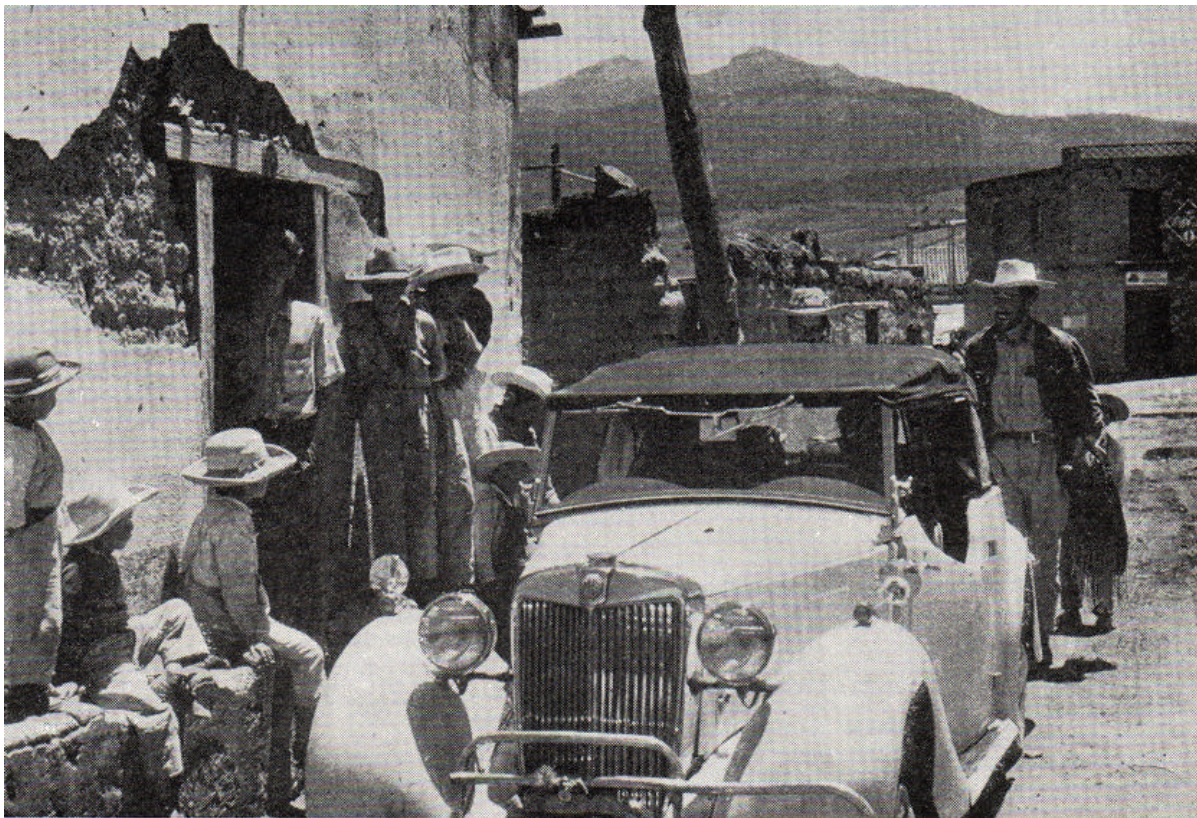
Back in comparative civilisation, the M.G. draws up at Zaragosa's only shop for refreshments. Pepi (on the right) is all smiles, but the twin peaks of Nevada de Toluca tower sternly in the background

'From here', Pepi assured us 'we can all come aboard.' We followed a dried-out river bed with