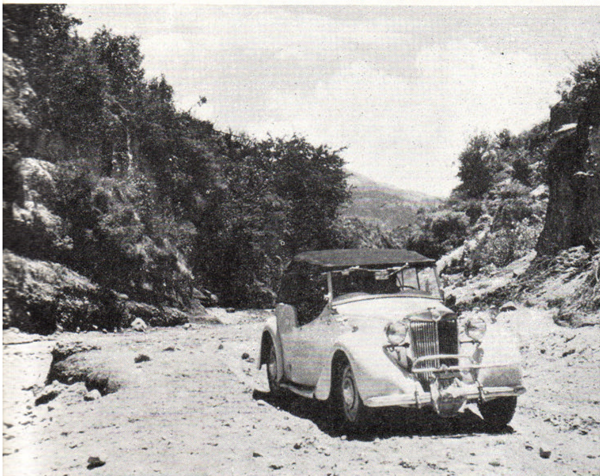
This was easy stuff: after their adventures on the mountainside, the trio (plus Pepi) had a nice dry river bed to take them towards Zaragosa.

A steep incline sloped to the shores of the lake, and we made the descent running, jumping and sliding in the soft lava ash. A roofless dwelling and metal crosses with inscriptions gave evidence of former habitation. Barrenness and silence engulfed us; not even the cry of a bird interrupted. It was an eerie place and we skirted the lake rapidly. As