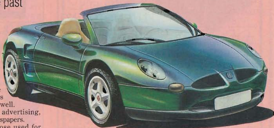
New MG should introduce whole new generation to sports cars

Yet there's a pleasant, relaxed feel throughout, despite the