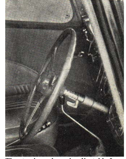
The steering column is adjustable for a 3 in. movement, and the 16 in. diameter wheel is spring spoked. Steering is by a rack and pinion type gear which is light and positive.

M.G. 1<sup>1</sup>/<sub>4</sub> litre the makers have achieved the perfect compromise between the racing-bred sports car and the stylish, family saloon.