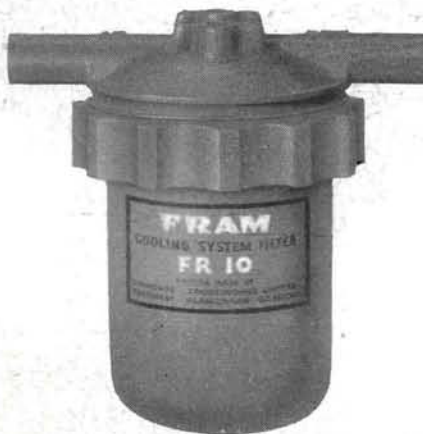
The new Fram cooling system filter.

Simmonds Aerocessories new Fram cooling system filter will have ready sales amongst discerning motorists. This filter removes all solids and assures a flow of clean water throughout the entire cooling system. It is also claimed that it inhibits corrosion and preserves the water passages in both engine and radiator. Some motorists are fortunate enough to live in areas where soft water is obtainable from the tap, but the majority of us live in hard-water areas and will welcome this new device.