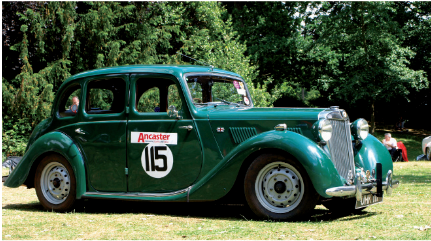
Above: Side profile of UHK 111 shows what an attractive car the MG YB was in period.