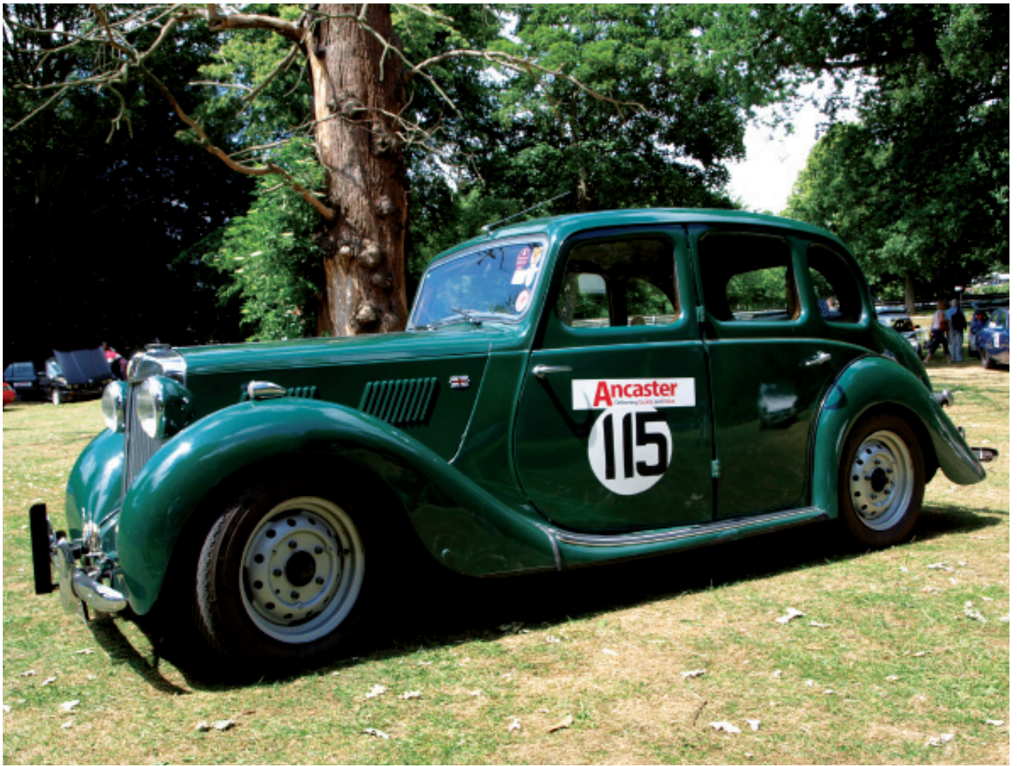
Above: Apart from the timing strut and the Crystal Palace Sprint sponsor's name above the number, the Jacobs MG YB is in the competition trim its original driver would have remembered.