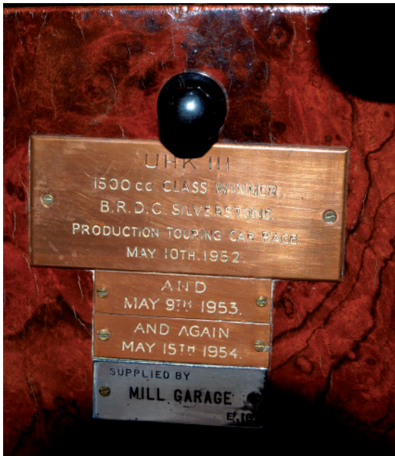
Above: Dashboard plaques proudly confirm unique competition history of MG YB UHK 111.