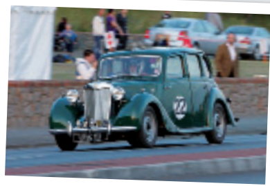
Above: Full bore for the MG YB on its way to a class win in the Moonlight Sprint at Victoria Avenue, St Helier at the Credit Suisse Jersey International Motoring Festival.