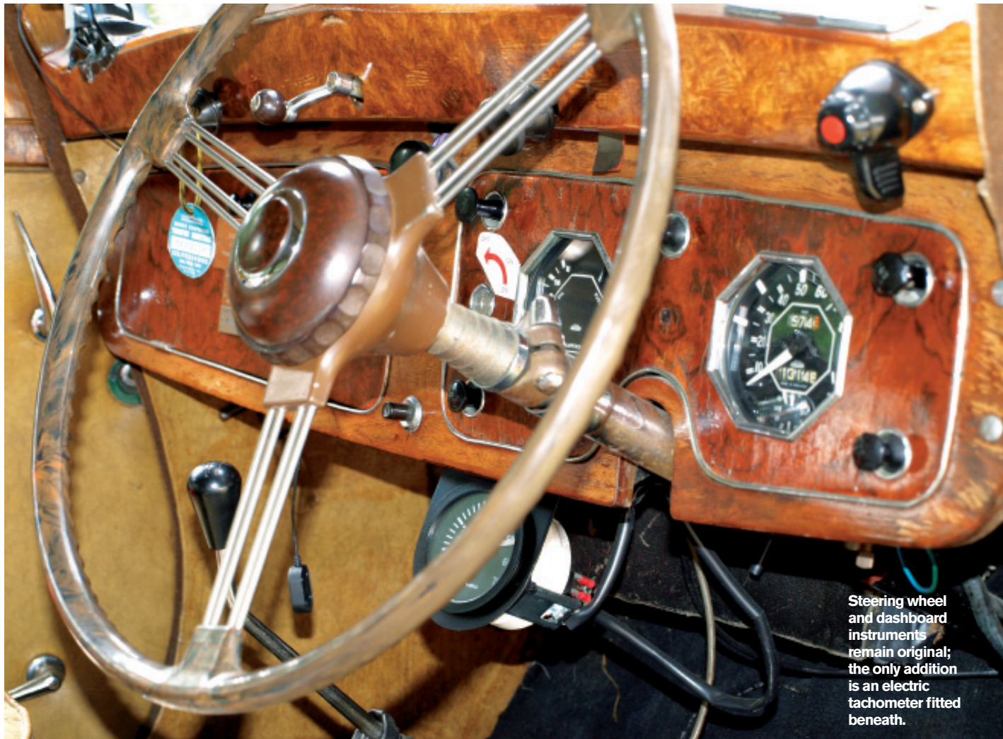
Steering wheel and dashboard instruments remain original; the only addition is an electric tachometer fitted beneath.