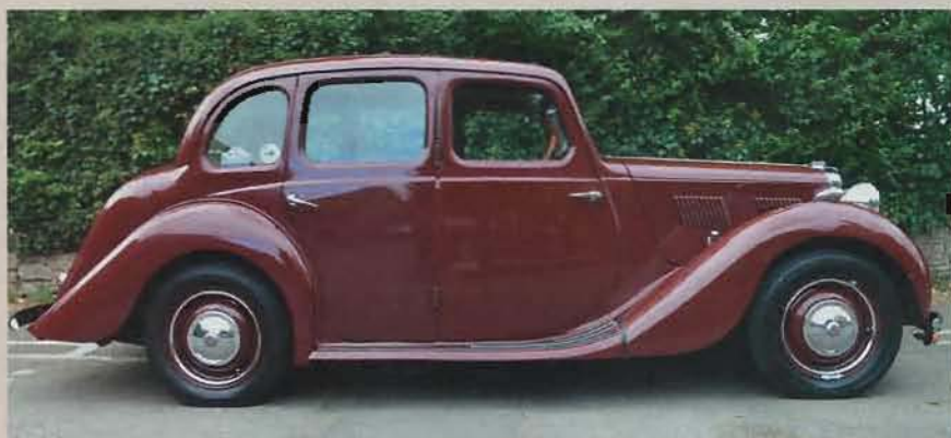
ABOVE: The prewar styling is clear, although the Y-Type did not go on sale until 1947. This is the later YB version, an update which was introduced in 1951.