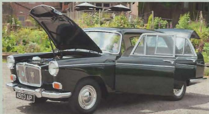
ABOVE: The Farina range were big, solid cars for the big, solid middle classes. They have a dedicated band of enthusiastic fans, and still offer fantastic family motoring.