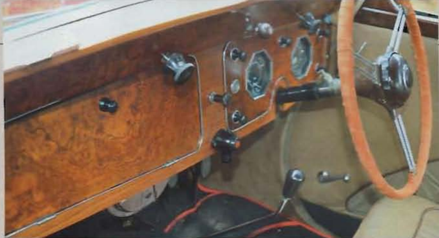
ABOVE: The cabin is very narrow by modern standards and feels cramped as a result, but there is no arguing with the quality of the fixtures and fittings.

pan,' Alan says. 'He found the oil to be as fresh as when he'd poured it in.'