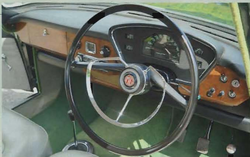
ABOVE: It may not be a sports car, but isn't that interior absolutely gorgeous?

has made some modification to his car to keep up with technology and road conditions. 'I've fitted a stainless steel exhaust with a chrome extension piece because it's impossible to source a mild steel version of the right length for this car, and I've added radial ply tyres because it's not possible to find 590 X 14 crossplies. I've also converted the vacuum wipers to electric for safety's sake, as well as fitting seat belts.'