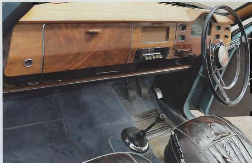
ABOVE: The interior clearly draws on themes established by the Y-Type, but with the full width body giving a far more modern and spacious feel to the cabin.

The MG proved to be a good purchase and Stephen drove it continuously for 12 months, only undertaking the usual service chores when necessary. 'I then began to make small modifications,' he continues. 'I fitted safety belts, added proper rear indicators instead of