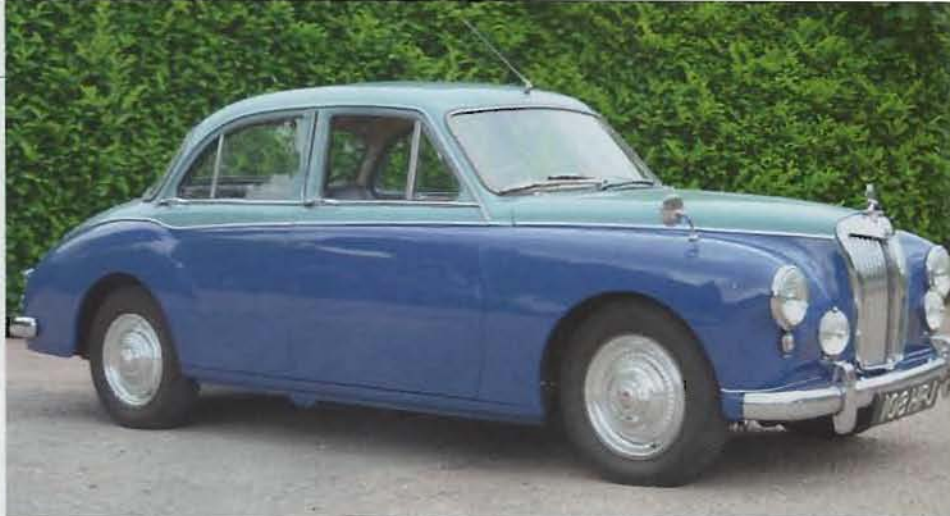
ABOVE: As the name suggests, most Varitones were painted in two different shades, separated by the chrome waist strip. They also had a bigger rear window.

Stephen's first excursion into classic car ownership came when he bought an MG Midget some 20 years ago.