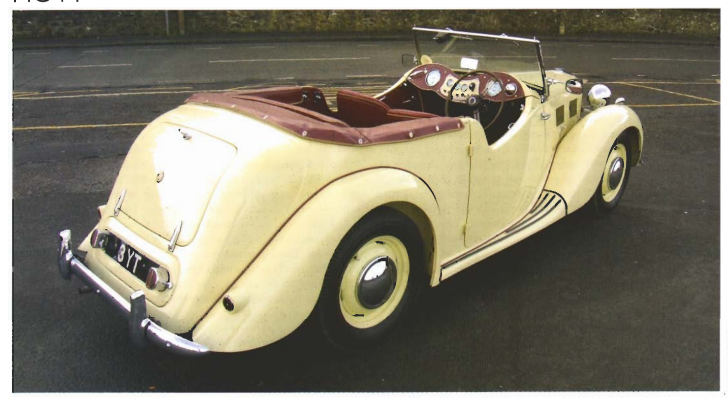
'THERE ARE AROUND 100 SURVIVORS, OF WHICH PERHAPS 40 ARE ROADWORTHY'