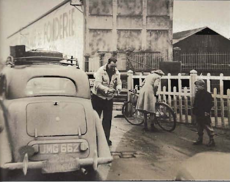
Pause at a French level-crossing. Rallying was a very different business in the 1950s: note the roof-rack and GB plate