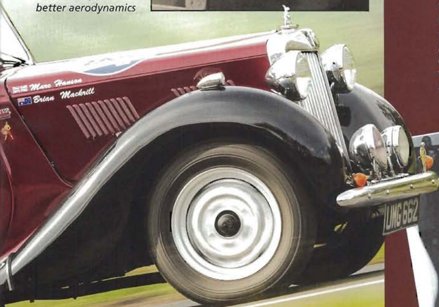
The five-speed Ford gearbox conversion fitted to the car makes cruising a lot more relaxed