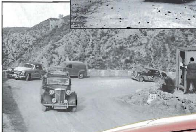
The MG on the Col des Lèques during the 1954 Monte – pursued, somewhat improbably, by a Triumph Mayflower