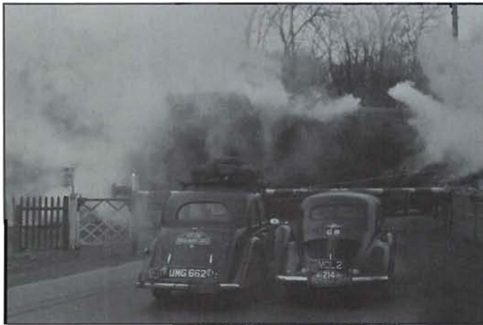
The MG serving as a press car on the 1953 Monte; alongside is a competing Acton-built Renault 4CV

Final details include an electric fan and a high-flow radiator. "The only time we got close to not finishing was when the car got hot, coming down from the mountains. With the improved cooling system never again has it got close to overheating." On top of this, there are the inevitable requirements for safe rallying – an extra spot light, LED lights and a reversing light at the back, flashing indicators, a high-level brake light. "It's important to be seen," says Marc. "At night you're at risk from drivers failing to spot the standard 1950s rear lights."