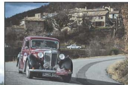
In the course of the 2017 Monte Carlo Classique. Even in demanding terrain the brakes have proved up to the job