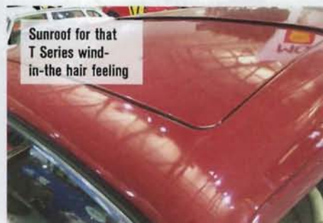
Sunroof for that T Series wind-in-the hair feeling