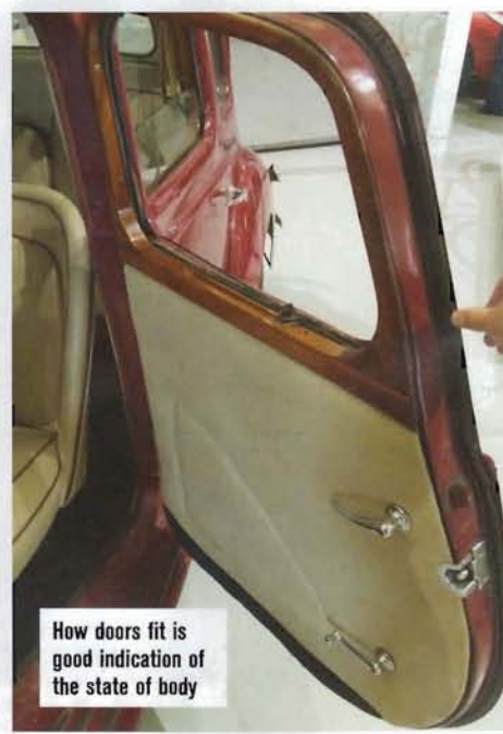
How doors fit is good indication of the state of body