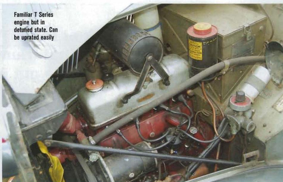
Familiar T Series engine but in detuned state. Can be uprated easily