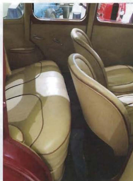
The Y Type is a four seater, albeit a cramped one at the rear although acceptable for short journeys

■ Have a good look at the steering wheel if it's original and not a T Series which may have been. The reason is that they were prone to cracking. There's not much that you can do here other than have it professionally restored – a useful bargaining point perhaps?