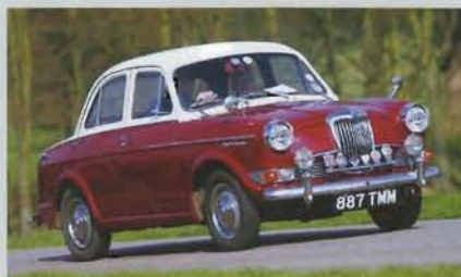
RILEY 1.5 WOLSELEY 1500

This is the car that replaced the Y Type and for many will be the better car – unless you yearn for pre-war looks. The B-Series engine provides brisker performance and can be uprated easier. ZB Varitone featured wider rear window among other enhancements. Similar in price to a Y Type, the Magnette makes a cheaper almost-as-good alternative to a Jaguar Mk1 or Mk2 in our minds.