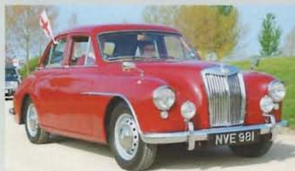
MG MAGNETTE ZA/ZB

This is the car that replaced the Y Type and for many will be the better car – unless you yearn for pre-war looks. The B-Series engine provides brisker performance and can be uprated easier. ZB Varitone featured wider rear window among other enhancements. Similar in price to a Y Type, the Magnette makes a cheaper almost-as-good alternative to a Jaguar Mk1 or Mk2 in our minds.