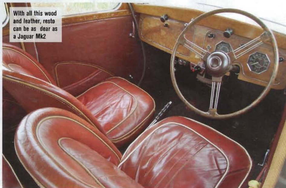
With all this wood and leather, resto can be as dear as a Jaguar Mk2