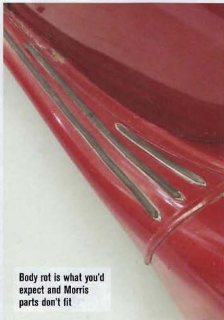
Body rot is what you'd expect and Morris parts don't fit