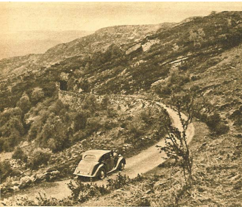
The mountain road which runs between Kilgarvan and Snave Bridge, at Bantry.

T HE idea of a touring holiday in Eire had for long been in our minds, so that when both time and tide unexpectedly proved propitious, we decided, without more ado, to translate the thought into action. About a week later, our appropriately coloured green 1¼-litre M.G. was driven along the railway station platform at Fishguard, for shipment to Waterford in the S.S. Princess Maud . The crossing was uneventful, although one or two rolls during the night made one hope that the M.G. had been secured in a proper seaman like fashion. We need not have