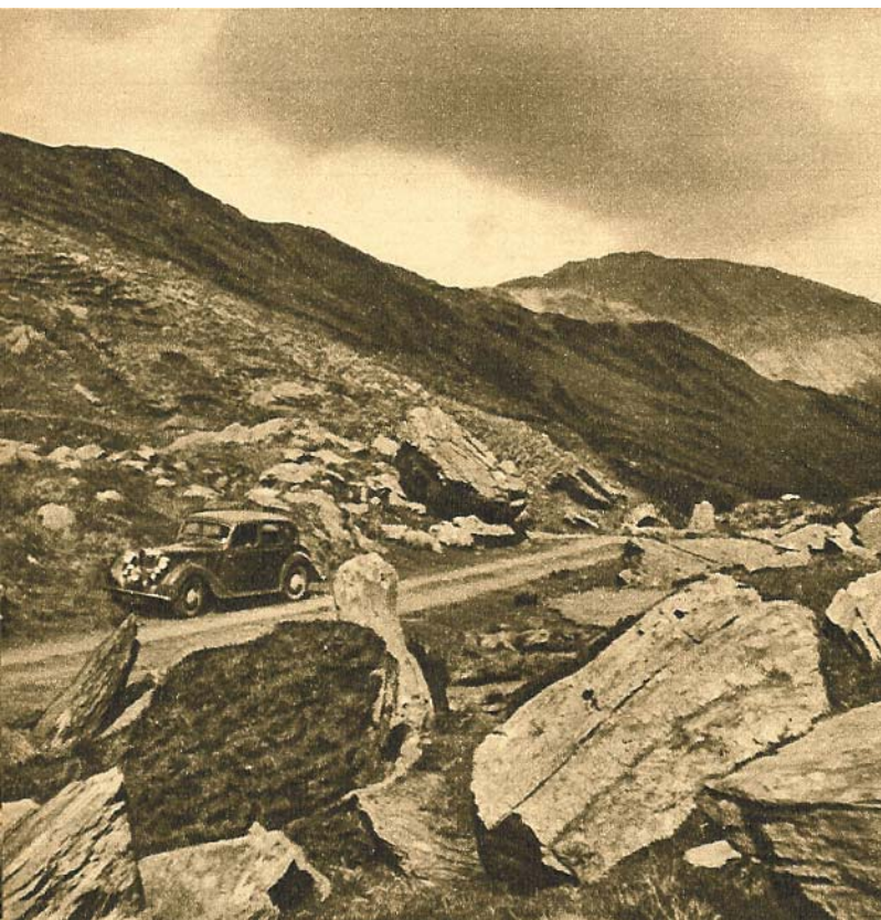
The large rocks by the roadside dwarf the M.G. as it stands at the summit of Ballaghbearna Pass, in MacGillycuddy's Reeks.

highest of Ireland's mountains, come into full view. Then follows a descent of some ten miles into Killarney, the scenery along this section being nothing less than magnificent. The Reeks were tantalizingly near—how could one get up to see them at close quarters? It was worth trying, and a road eventually was found by Gearha Bridge over the Blackwater, by Kenmare River, which seemed to offer possibilities. From the solitary lonely looking signpost where the road forked, we gathered that it led to Glencar. The name meant nothing to us, but the road, so far as its course could be followed by the eye, apparently disappeared into the very heart of the mountains.