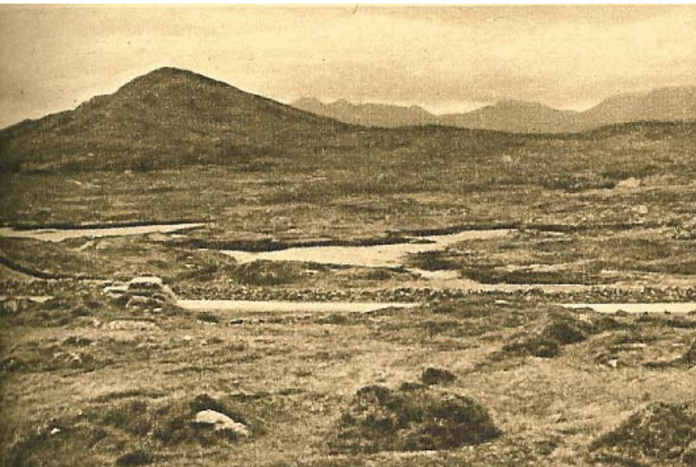
Typical of the Connemara coastal scenery and depicted on innumerable occasions by Victorian watercolour painters; the road to the coast at Carna, from Recess, with the Twelve Pins in the background.

From Ennis we made our way to the coast at Lahinch, a popular seaside resort, with fine sands at Liscannor Bay.