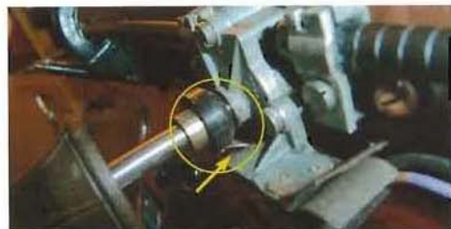
Here we can see the conic bakelite ring which (in pressed-in position) opened the contact tongue of the switch