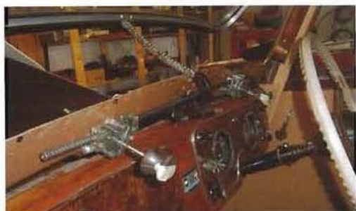
The wiper arrangement with driving links (wheel boxes) and the push and draw cable.