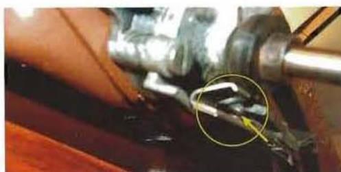
... and here the points, now open, which give earth (in closed position) to the wiper motor.

The parking knob is pulled out and the points are in contact, so the wiper motor runs now.