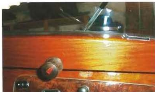
I marked the parking knobs to screw the wiper arms tight in the correct position